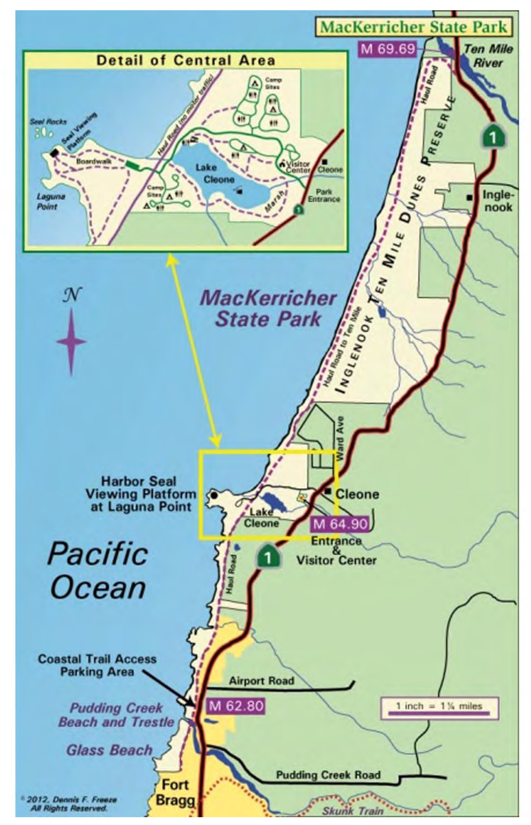
Figure 1. Map of MacKerricher State Park (Freeze 2008).