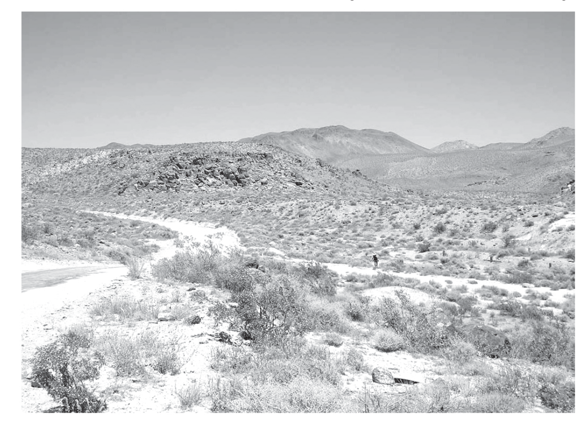
Figure 5: Overview of CA-INY-5952.

The eastern grid system was set up over a much larger area and used more for mapping control purposes. The grid points were placed at 25 m intervals along a north-south axis and an east-west axis. Eight