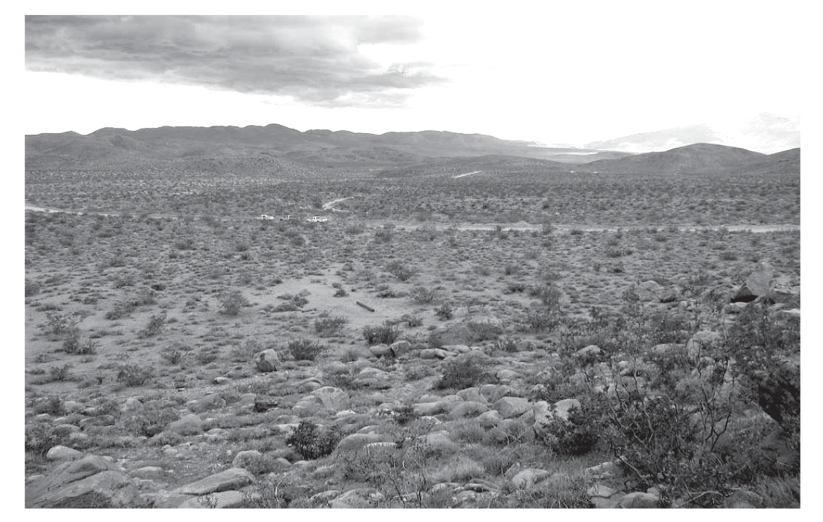
Figure 3: Overview of site CA-INY-2334.

The data at INY-2334 suggest that the site was focused on production of bifaces, possibly with the intention of transport or trade. The preponderance of the materials collected was early and late biface thinning flakes, suggesting that this was a very important activity. Also present at the site is a habitation component. There were multiple milling slicks situated around the dry drainage, numerous metates located near the western edge of the site, and three identified thermal features near the northern boundary.