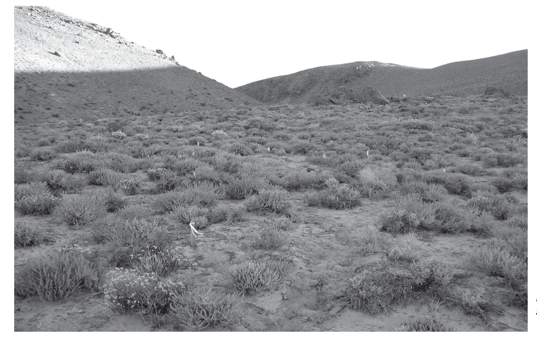
Figure 4: Overview of site CA-INY-3669.

channel; a small number of artifacts were found on the slope to the west of the bench edge, and none were found on the canyon floor. For management purposes, the site was divided into two loci, A and B.