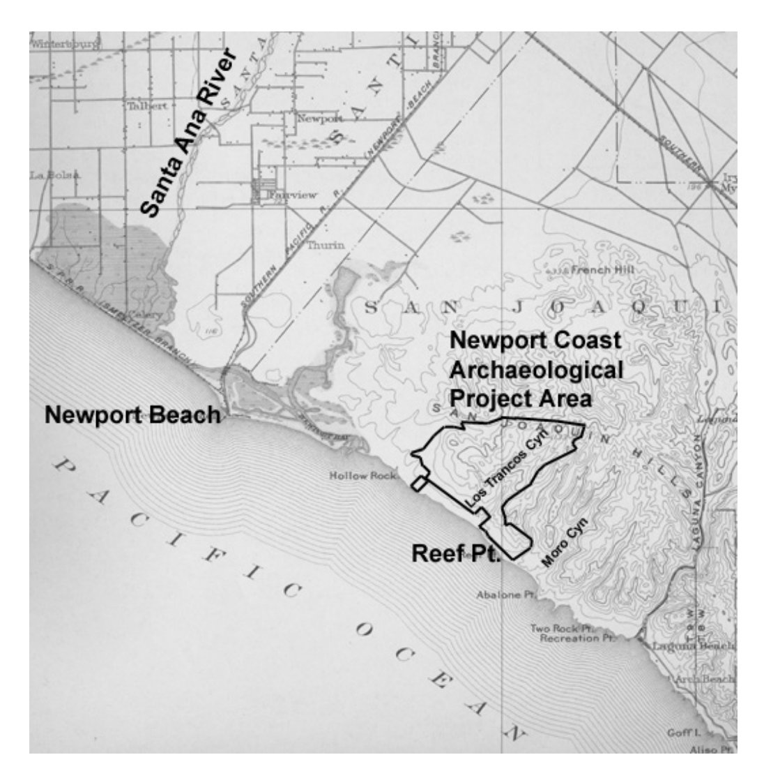
Figure 1. Location of Newport Coast Archaeological Project (NCAP) shown on a portion of the 1901 USGS Santa Ana topographic map (scale = 1:62,500).

In addition to the systematic, statistical sample, a purposive sample of judgmentally placed units was excavated in open sites to find and expose fire-affected rock features. In most cases, placement of the purposive units was based on the location of magnetometer anomalies. When features were encountered, purposively placed 1 x 1 m "expansion" units were excavated to fully expose the feature and recover the associated cultural material. These purposive or judgmentally placed units provided increased samples of areas of more concentrated cultural material associated with the features. Soil samples for