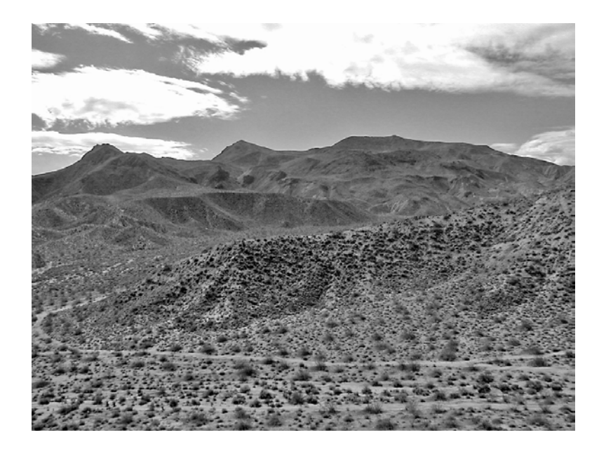
Figure 3. Lava Mountains with Bedrock Canyon in the background and the Summit Range in the foreground in the vicinity of CA-SBR-1197.

the site (Figure 4). Known archaeological resources in the vicinity of SBR-1197 include midden areas, rock shelters, rock alignments, pictographs and petroglyphs, milling features, roasting pits, and scatters of thermally fractured and flaked stone. A number of boulders containing petroglyphs are located near the perimeter of the site, and one sits within the site boundary at the lower end of the site, opposite