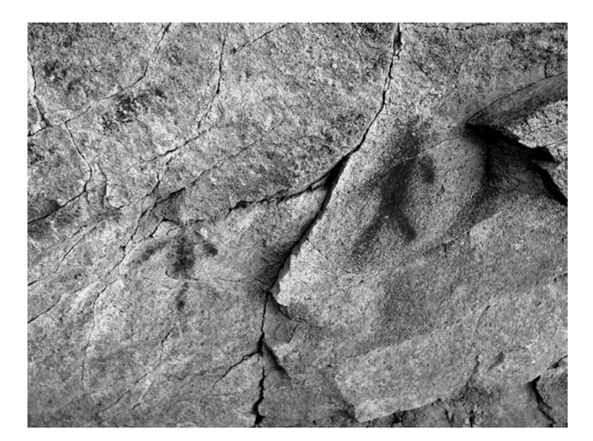
Figure 7. Pictographs at Bedrock Spring using DStretch to clarify images.

The range and density of prehistoric resources indicate considerable use of the area. Proximity to the only known significant potable water source in the vicinity and to easily obtainable varieties of stone for tool manufacture made the area an attractive location for occupation. Bedrock Spring likely attracted a variety of game. A number of the nearby sites contain metates and grinding slicks, indicating the processing of plant resources. Historic period cultural resources in the vicinity were associated with use of Bedrock Spring as a water stop for wagon travel along the canyon, limited mining exploration, and cattle grazing.