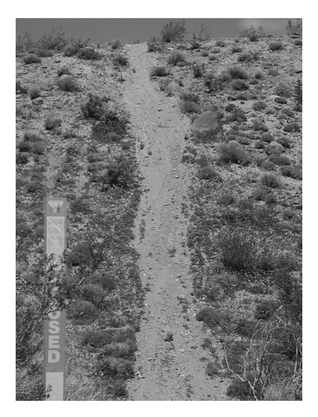
Figure 2. Unauthorized vehicle use near CA-SBR-1197; small boulder adjacent to vehicle track in upper right portion of photo contains petroglyphs.

At the time that site stewardship monitoring began within the Bedrock Spring ACEC, the surface of SBR-1197, vandalized some time before 1976, still clearly showed evidence of the illegal digging. The surface of the site had not recovered from the effects of what appeared to be a major episode of unauthorized excavation; back dirt piles were readily apparent and clearly indicated digging activity, the soil surface showed little or no sign of recovery, and almost no vegetation recovery had taken place to hide the scars left by the disturbance.