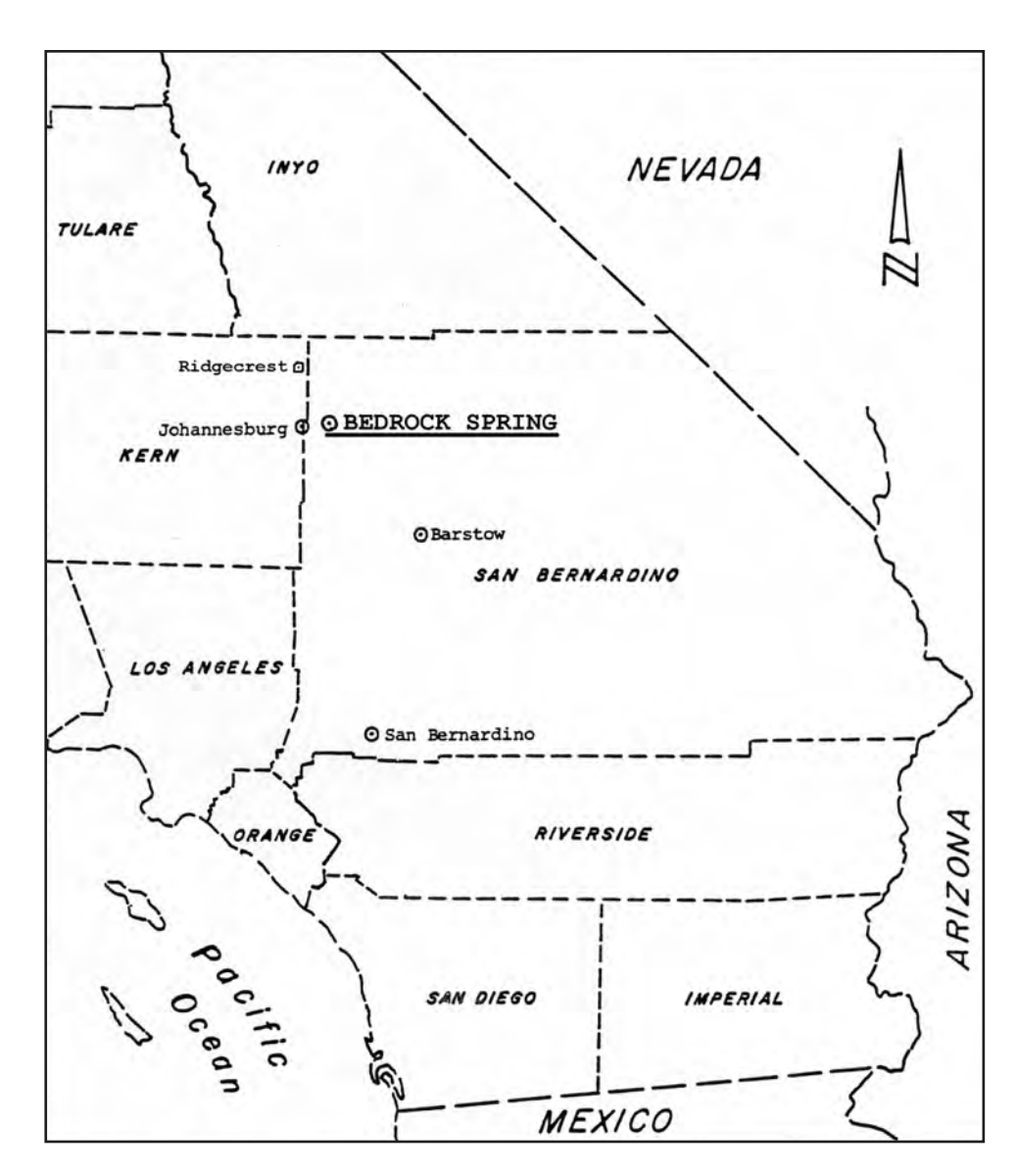
Figure 1. General location of Bedrock Spring and CA-SBR-1197.

ously vandalized prehistoric site (SBR-1197) within the Bedrock Spring ACEC (Figure 1). Since there were several similar sites in proximity, the obviously vandalized state of SBR-1197 could encourage additional vandalism. The site steward reported significant problems with unauthorized vehicle travel throughout the ACEC by vehicles that were accessing the Spangler Hills Off-Highway Vehicle Area to the north of the ACEC. Although unauthorized cross-country routes within the ACEC were signed