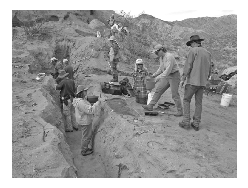
Figure 9. Second excavation phase (2002), excavating units in sides of T-trench; in background, excavation of a 1 x 2 m unit begun during the first excavation phase in 2001.