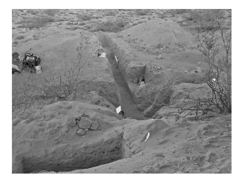
Figure 8. 2002 T-trench with first units placed into the wall of the trench. The 1 x 2 m unit in the foreground was begun in 2001 and completed in 2002.

location for those who occupied the site, and dirt piles left from the illicit digging. Prior to the second excavation phase in 2002, a T-trench was dug by backhoe into the site, exposing the soil profile across the entire site (Figure 8). The primary trench was dug from the lower elevation of the site to the upper elevation under the shelter. The cross trench was placed at the upper end of the site in front of the shelter. Units were excavated into the sides of the backhoe trench (Figure 9), and