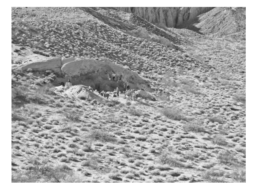
Figure 4. CA-SBR-II97 is situated on a northwest-facing slope at the base of an eroding sandstone formation.