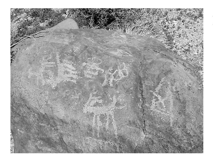
Figure 6. Boulder at CA-SBR-1196 containing quadrupeds and other elements, approximately 500 m northeast of SBR-1197.