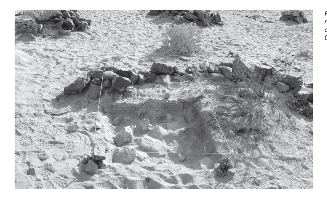
Fig. 7. Rock alignment (Feature 4) during excavation, CA-SBR-12134/H.