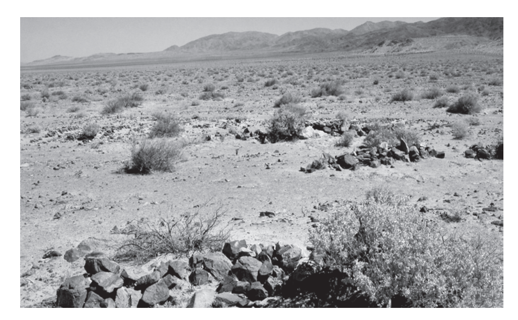
Fig. 2. Rock Features at Eastern Searles Lake site CA-SBR-12134/H.

Cairns are a common type of feature that consist of piled stacks of rocks placed in a circular fashion. Jett (1986:615) identified 35 native ethnic groups in North America that employed trail side cairns. The function of cairns is not always obvious, although there are instances where they were used in mortuary practices, to cover the dead, or as cairn burials (Halford and Carpenter 2005). Moratto (1984:129–130) noted several sites on the Santa Barbara sub-