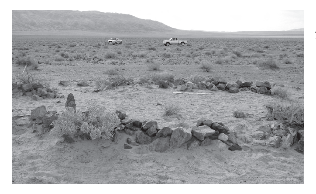
Fig. 4. CA-SBR-12134/H, Locus A, proposed habitation area.