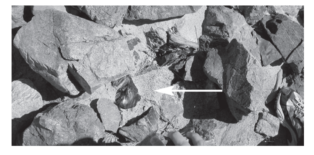
Fig. 6. Arrow points to obsidian debitage inside rock cairn, Locus A.