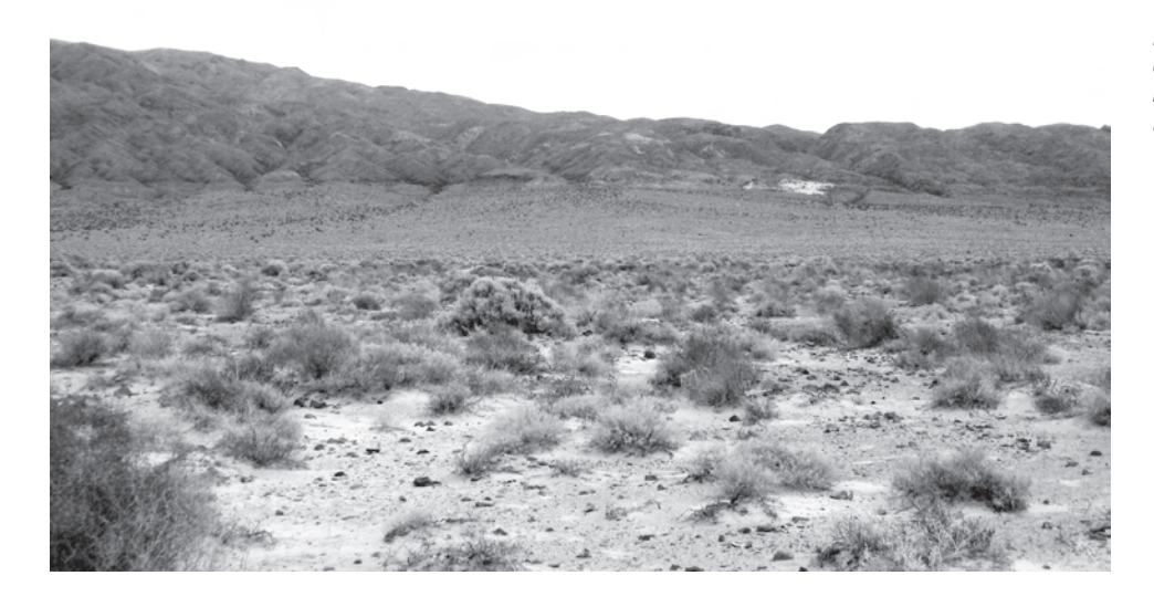
Fig. 1. Eastern side of Searles Lake looking toward the Slate Mountain Range.