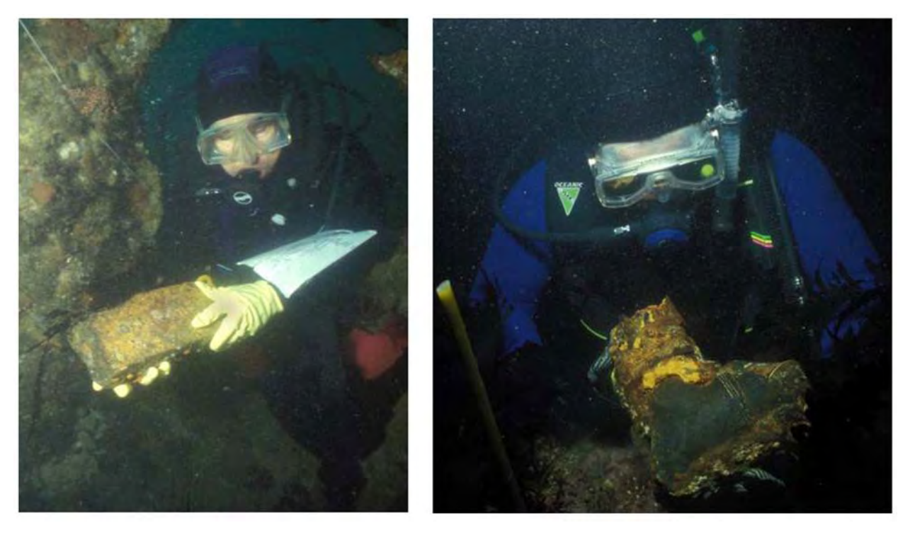
Figure 3. Scuba diver retrieving a "Carnegie" brick from the Pomona's boiler's firebox (left) and valve (right).

natural wonders of the world, and weekly boat excursions attracted tourists to the bay for sightseeing (Scott 1957).