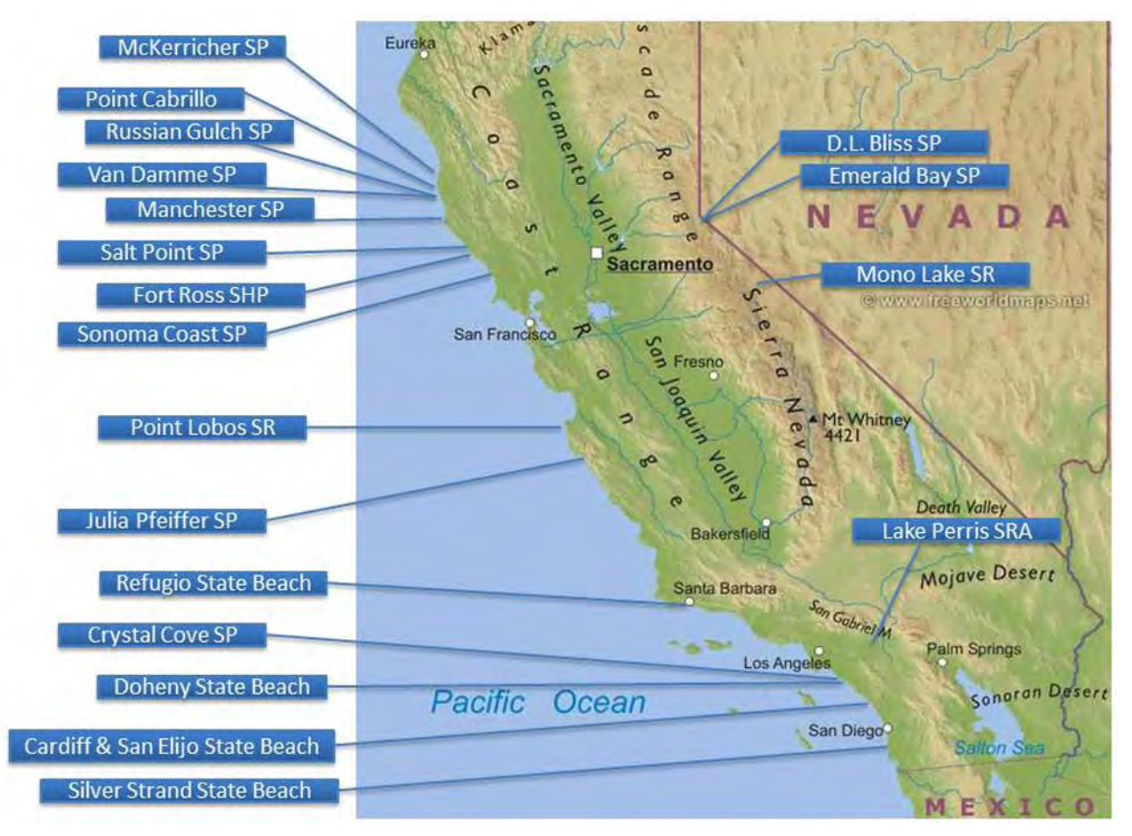
Figure 1. Underwater parks managed by California State Parks.