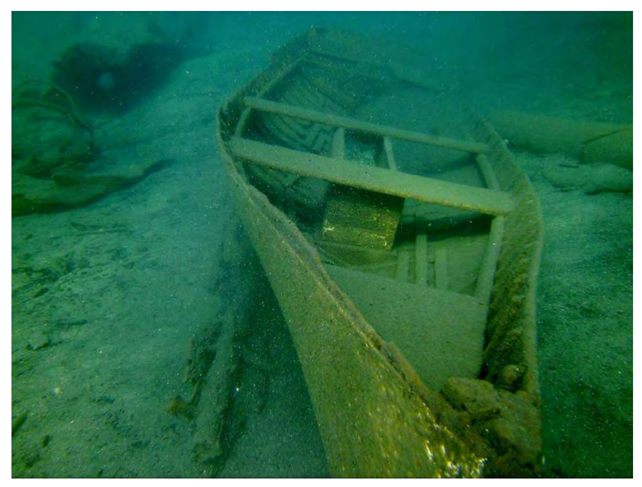
Figure 6. Small fishing boat, a component of Emerald Bay Resort "Mini-fleet."