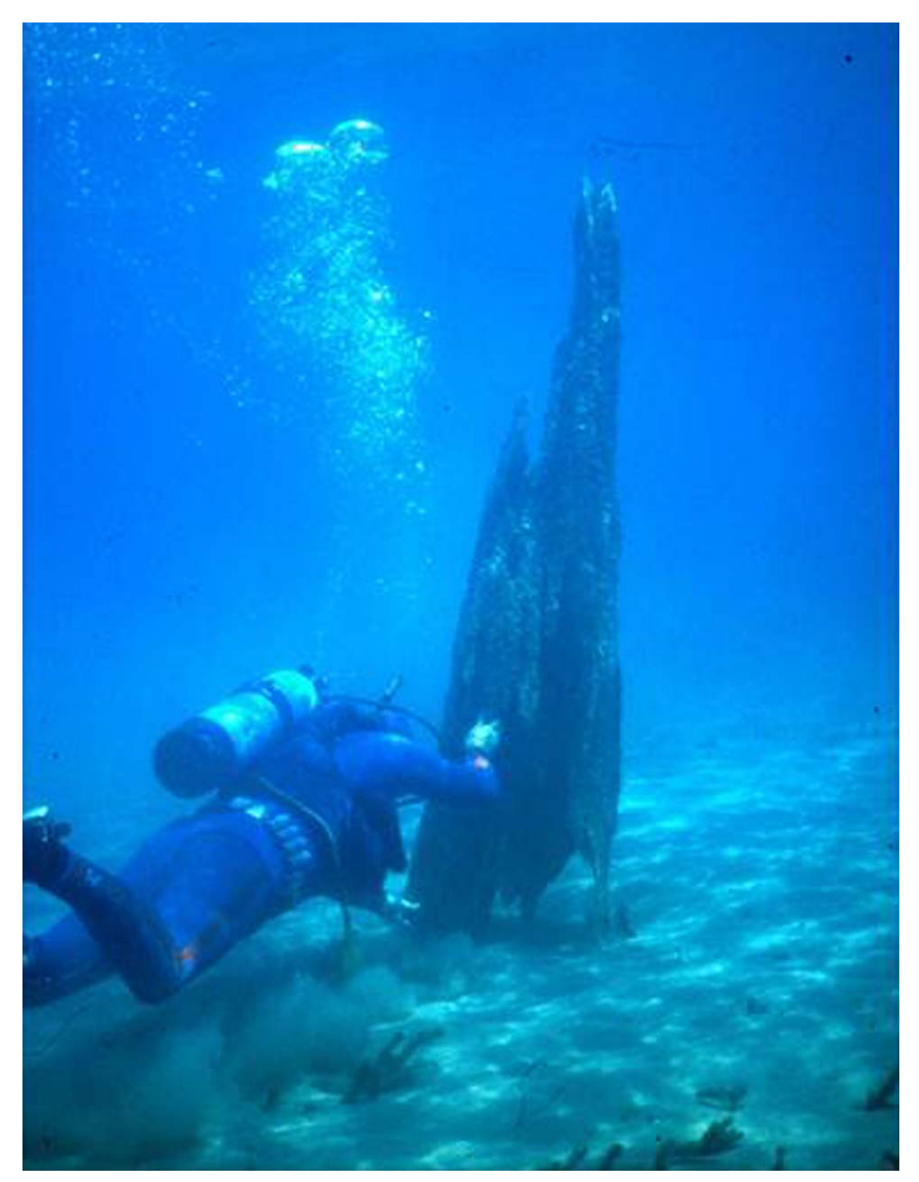
Figure 5. Diver taking a sample from submerged stump along Lake Tahoe shoreline.