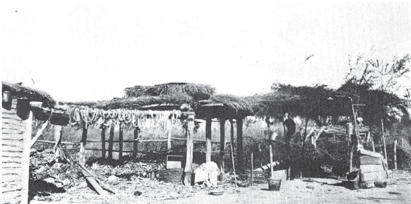
Figure 4: Cocopa summer house, jacal, and ramada with drying pumpkins strips (Source: Edward H. Davis, 1923).

On these sacred peaks, one may be able to confer with spirit beings to learn from them and gain wisdom. Various origin events took place on these mountains, and these events can be re-witnessed in dreams. For these reasons, mountains and the trail systems linking them hold vital spiritual significance to the traditional Pan-Yuman peoples.