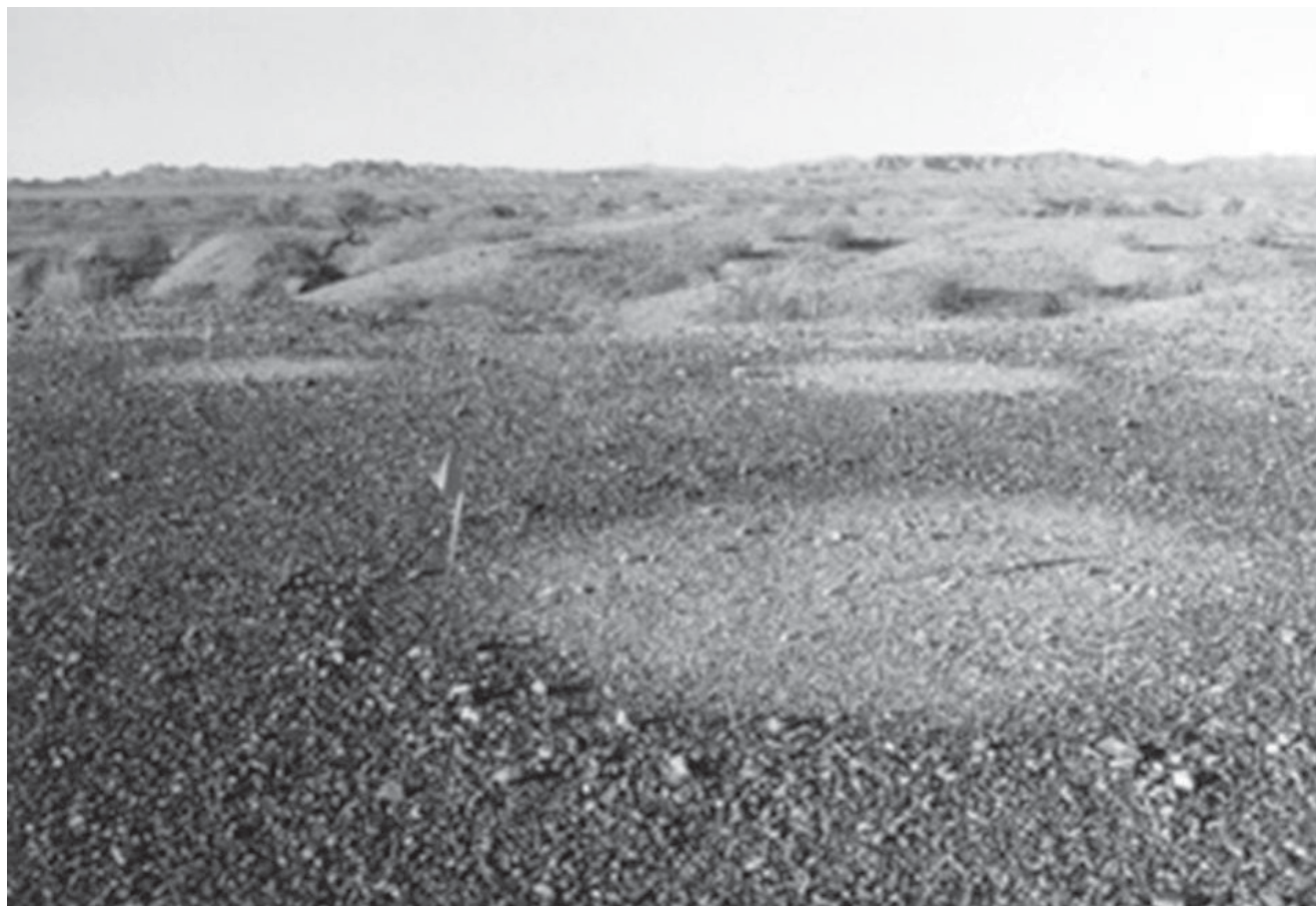
Figure 5: Sleeping circle.