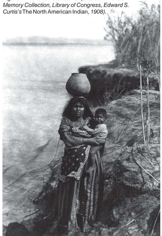
Figure 2: Mohave water carrier (Source: American Memory Collection, Library of Congress, Edward S. Curtis's The North American Indian , 1908).