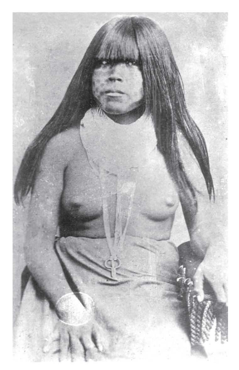
Figure 1. Postal card image of a face-painted Mohave girl. Photographic restoration by Doug Westfall.

Assuming that Native pigment adorned our maiden and not some commercial colorant purchased from a white trader, her non-symbolic, geometric display likely developed from finger applications of pulverized red ochre that had been kneaded into deer fat and subsequently warmed in a pot sherd (see Taylor and Wallace 1947:187). The red colorant would have been obtained from the Walapai, while the grease would have been secured from either Walapai or Yavapai. Black paint was verboten for females' face painting per se, however, a small amount of black applied as mascara using a tiny