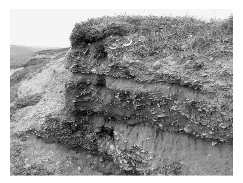
Fig. 2. Dense stratified shell midden exposure on San Miguel Island.

Channel Islands currently contain one of the earliest, most extensive, and best preserved archaeological records of maritime peoples in the Americas.