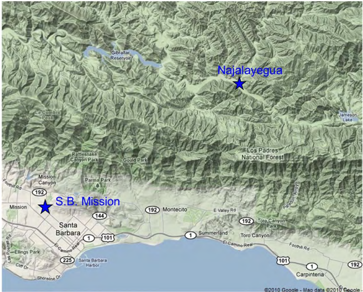
Figure 1. Vicinity map.

cooler, wetter climate gave way to the drier Madro-Tertiary flora eventually characterized by chaparral species. Fire response plant species developed along with landscape-changing wildfires that came in cyclical events (Mensing 1999). Conventional archaeological thought has been limited by little research and analysis focused on interior sites. In addition, landscape changes, over time, created significantly different conditions for archaeological discoveries than those of the coastal plain and Channel Islands.