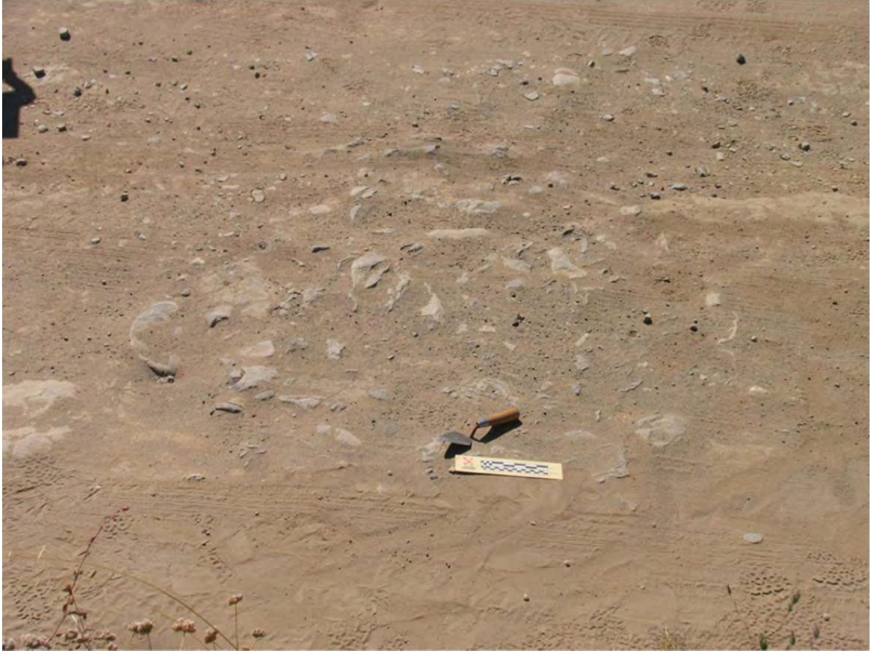
Figure 7. Hearth feature in August 2010 with noticeably more rock exposed.