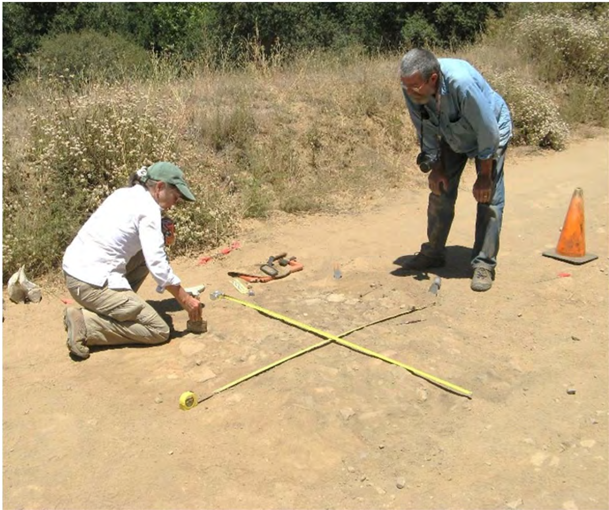
Figure 9. Hearth feature on road bed marked with crossed tape measures. Note the adjacent road berm resulting from road maintenance.