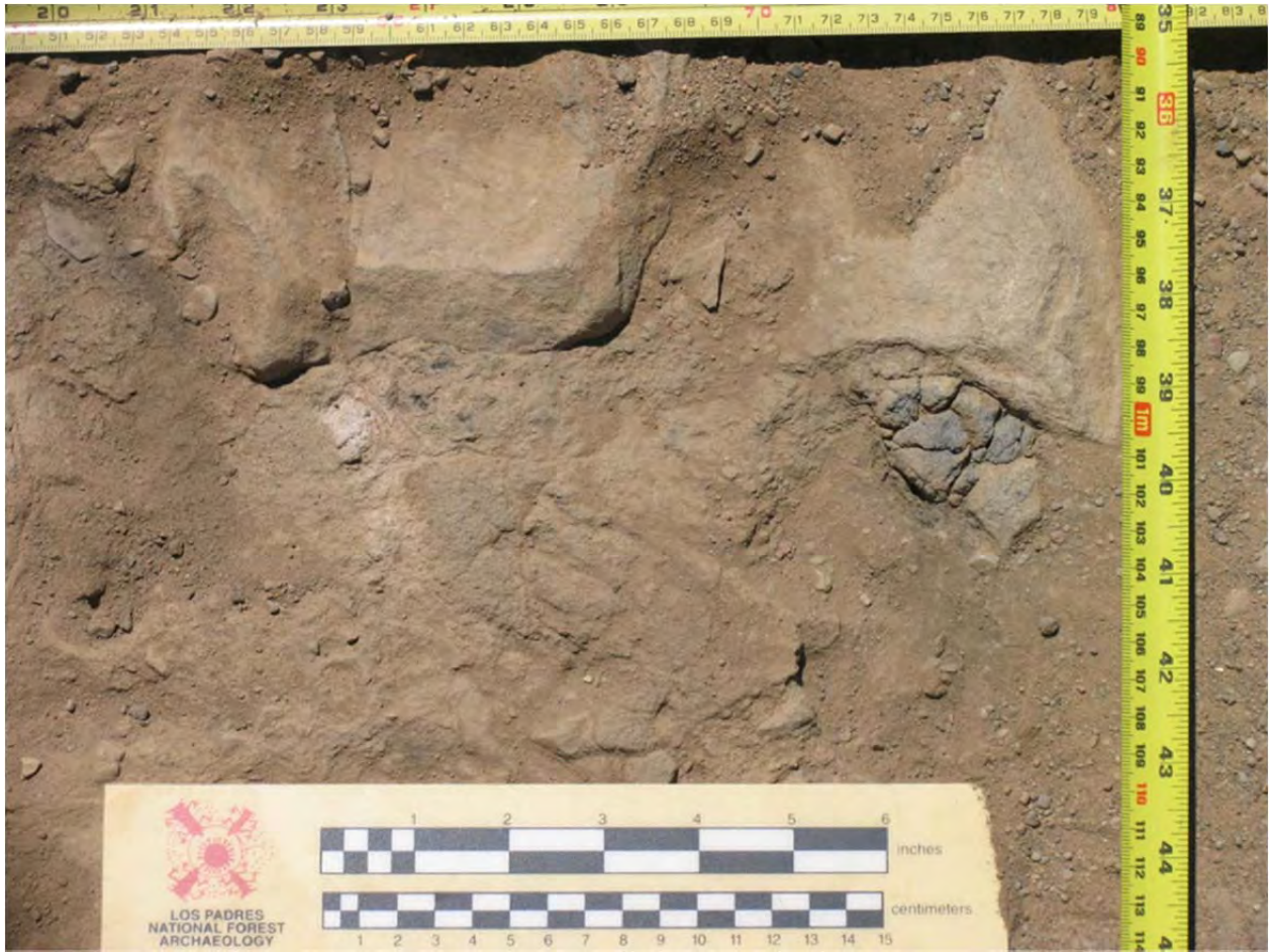
Figure 10. Fire-hardened soil at the center of the Hearth feature.