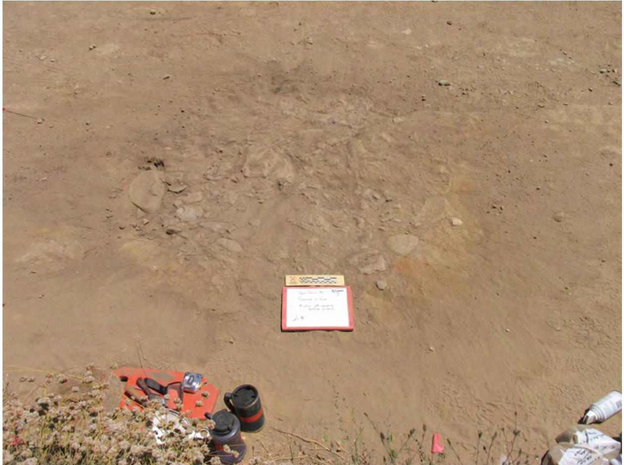
Figure 8. Hearth feature, August 2010, after initial brushing. Significantly more fire reddening and blackening is visible.