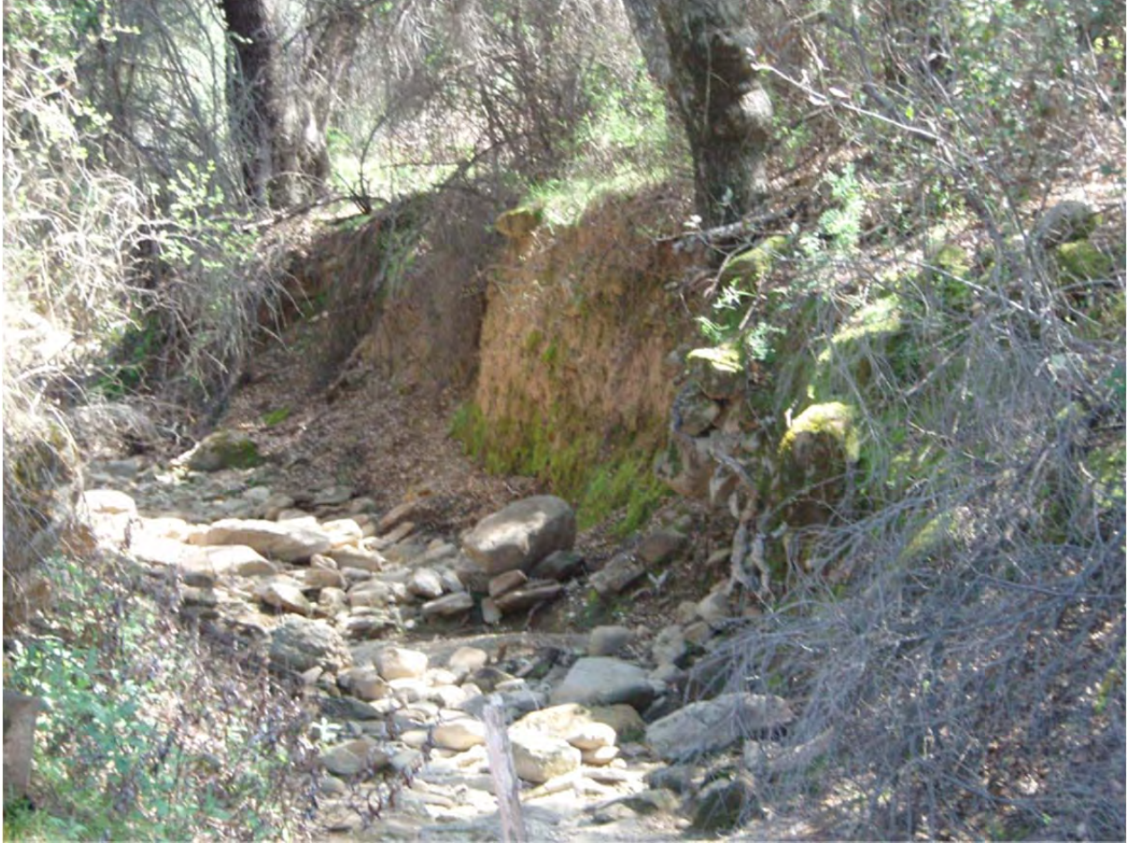
Figure 3. Closer aspect of the Shell Lens, with the face of the deposit visible as a green layer.

We removed 2 to 5 cm of soil. Within this matrix we found more fragmented shell, chipped stone fragments and very small fragments of charcoal. The feature measures approximately 160 cm in diameter, as marked by the crossed tape measures in Figure 9. The prominent berm adjacent to the road bed, also visible in the figure, speaks to another agent of exposure: road maintenance with heavy equipment.