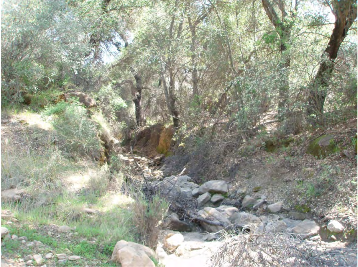
Figure 2. Shell Lens aspect as seen from the road.

observed almost 20 years earlier. The apparent sudden appearance of an archaeological deposit in the roadway was puzzling. (The Shell Lens was unknown until 2008.) The mystery was solved when we observed the road marker, seen in Figure 5. The cement bowl holding the road marking rod is clearly evident hanging on the side of the road cut. The position of the marker represents nearly 1 m of soil loss and vertical drop in the road surface since 1974, and mostly by 1993.