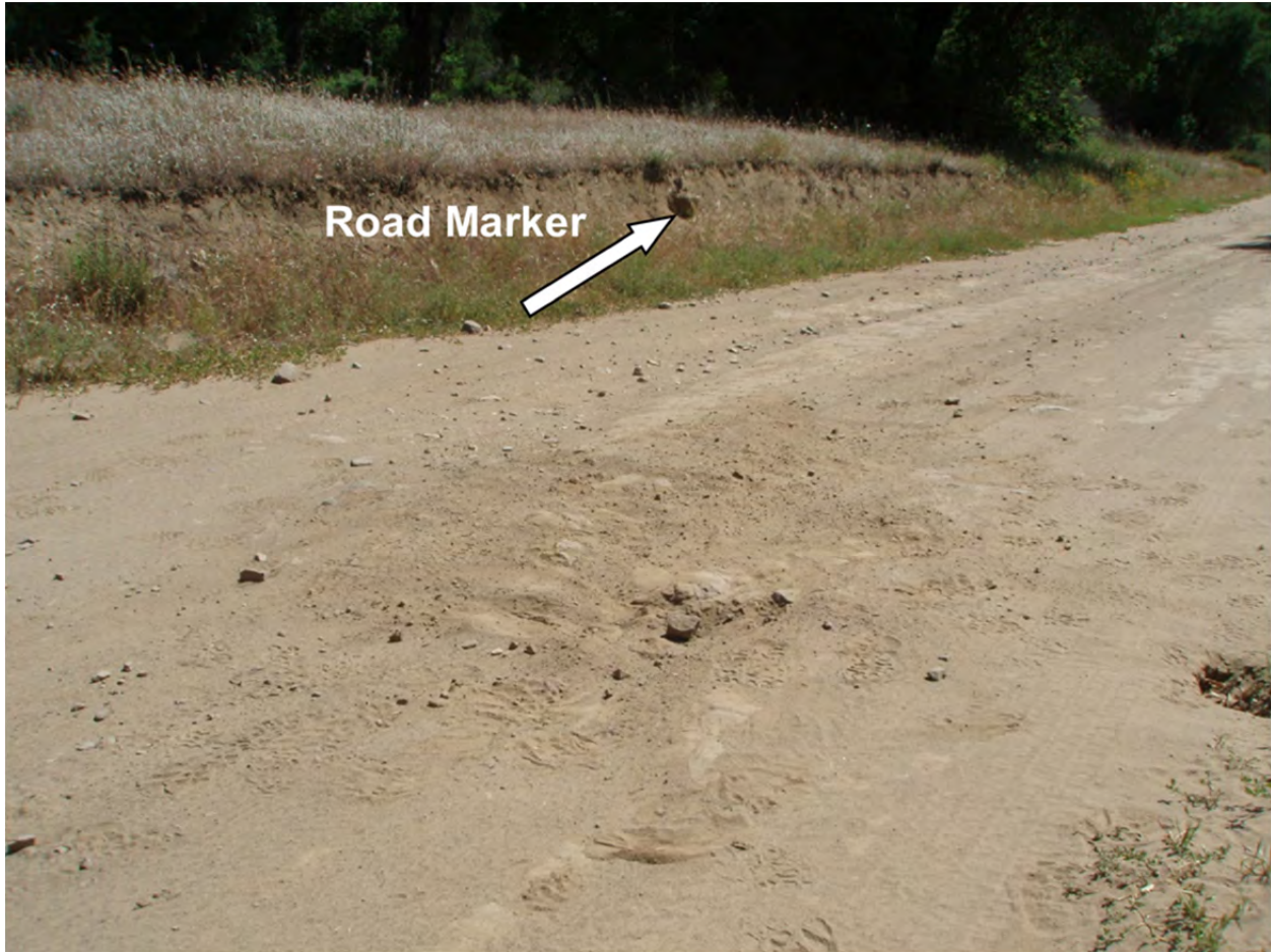
Figure 5. Road Marker on road cut face indicating road level in 1974.