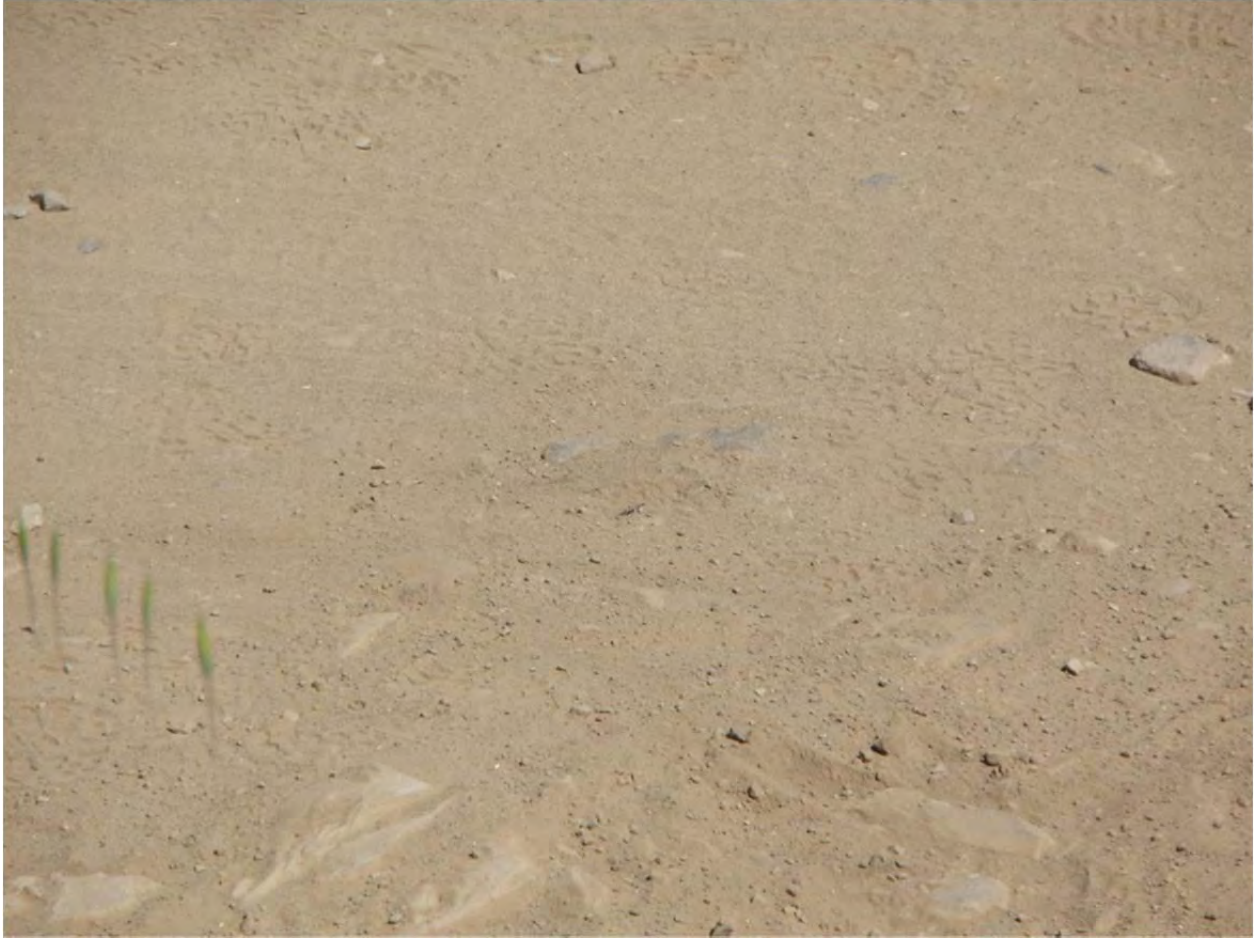
Figure 6. Hearth feature in road bed as seen in June 2010 with some red and black staining.