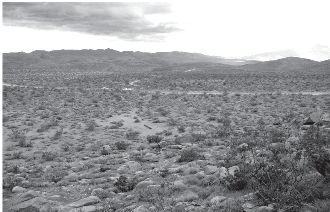
Figure 3: Overview of site CA-INY-2334.

The data at INY-2334 suggest that the site was focused on production of bifaces, possibly with the intention of transport or trade. The preponderance of the materials collected was early and late biface thinning flakes, suggesting that this was a very important activity. Also present at the site is a habitation component. There were multiple milling slicks situated around the dry drainage, numerous metates located near the western edge of the site, and three identified thermal features near the northern boundary.