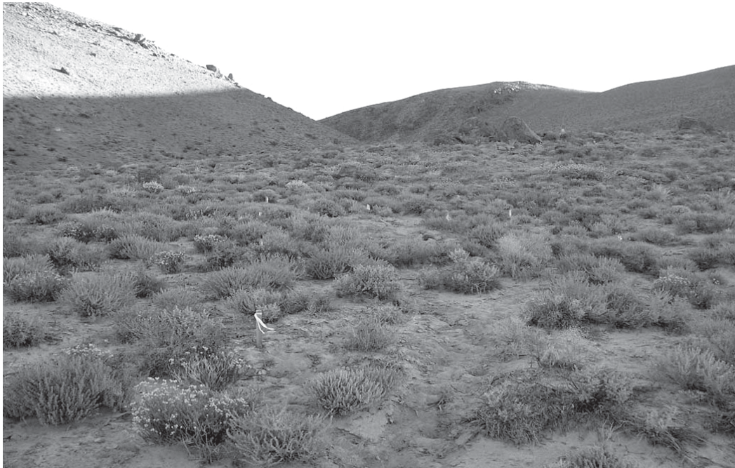
Figure 4: Overview of site CA-INY-3669.

channel; a small number of artifacts were found on the slope to the west of the bench edge, and none were found on the canyon floor. For management purposes, the site was divided into two loci, A and B.