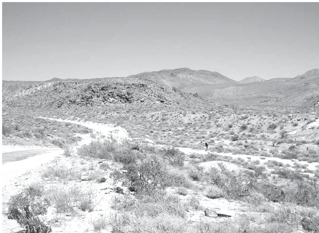
Figure 5: Overview of CA-INY-5952.

The eastern grid system was set up over a much larger area and used more for mapping control purposes. The grid points were placed at 25 m intervals along a north-south axis and an east-west axis. Eight