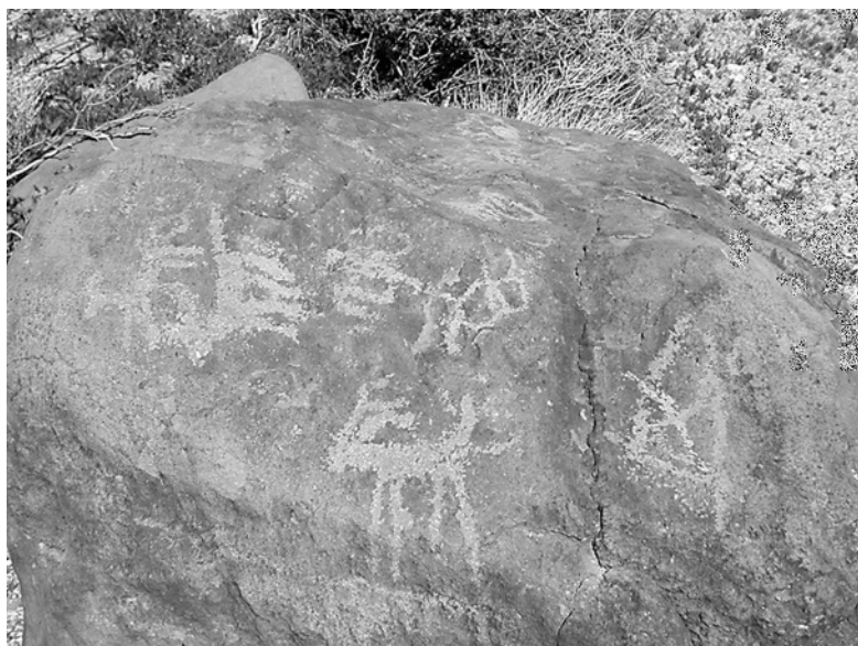
Figure 6. Boulder at CA-SBR-1196 containing quadrupeds and other elements, approximately 500 m northeast of SBR-1197.