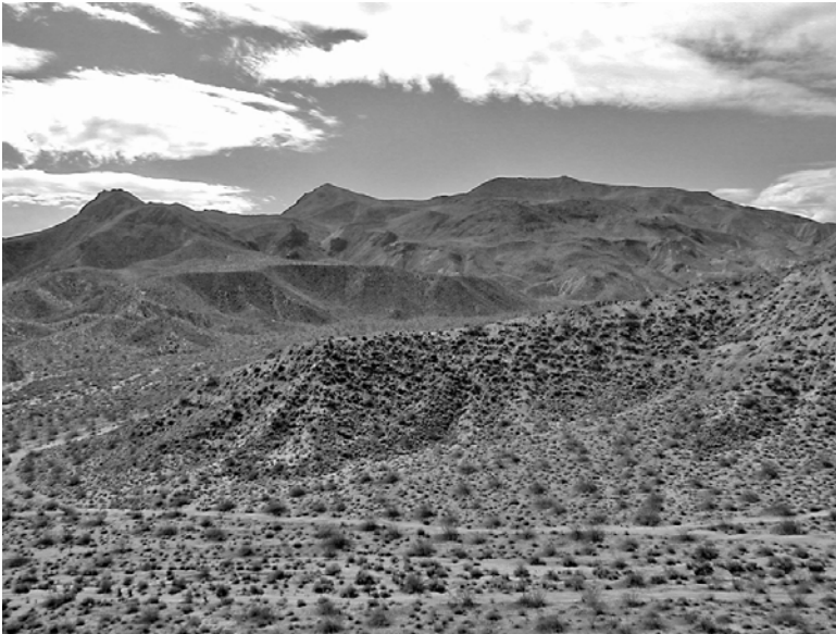
Figure 3. Lava Mountains with Bedrock Canyon in the background and the Summit Range in the foreground in the vicinity of CA-SBR-1197.

the site (Figure 4). Known archaeological resources in the vicinity of SBR-1197 include midden areas, rock shelters, rock alignments, pictographs and petroglyphs, milling features, roasting pits, and scatters of thermally fractured and flaked stone. A number of boulders containing petroglyphs are located near the perimeter of the site, and one sits within the site boundary at the lower end of the site, opposite