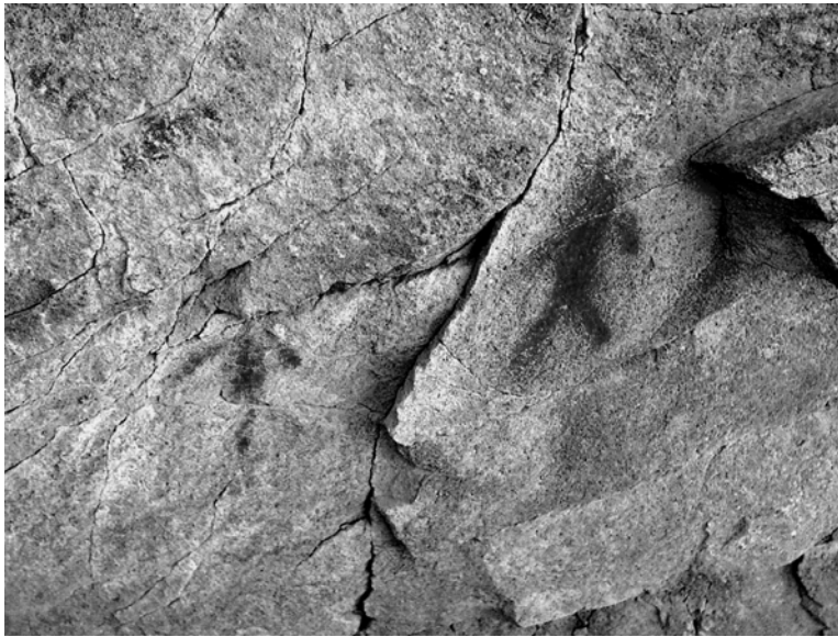
Figure 7. Pictographs at Bedrock Spring using DStretch to clarify images.

The range and density of prehistoric resources indicate considerable use of the area. Proximity to the only known significant potable water source in the vicinity and to easily obtainable varieties of stone for tool manufacture made the area an attractive location for occupation. Bedrock Spring likely attracted a variety of game. A number of the nearby sites contain metates and grinding slicks, indicating the processing of plant resources. Historic period cultural resources in the vicinity were associated with use of Bedrock Spring as a water stop for wagon travel along the canyon, limited mining exploration, and cattle grazing.