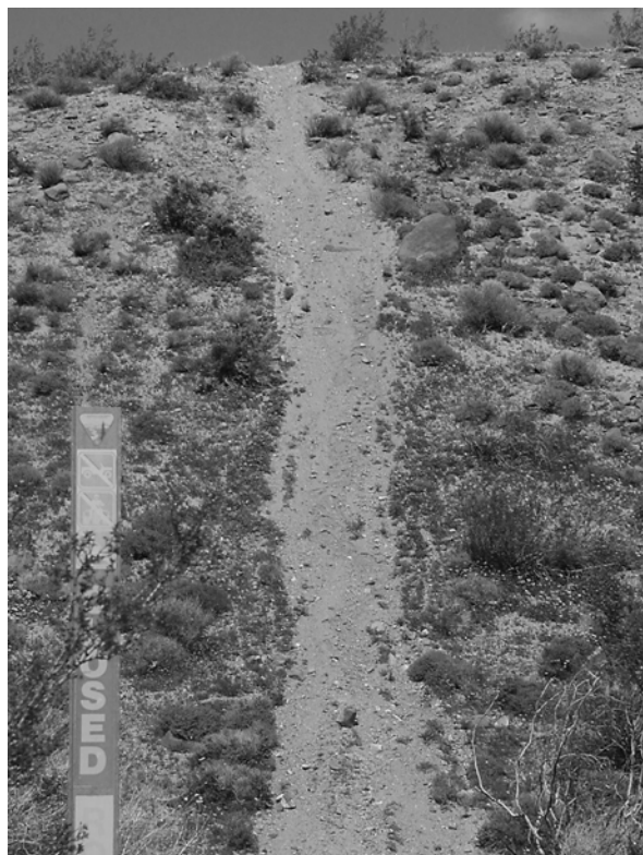
Figure 2. Unauthorized vehicle use near CA-SBR-1197; small boulder adjacent to vehicle track in upper right portion of photo contains petroglyphs.

At the time that site stewardship monitoring began within the Bedrock Spring ACEC, the surface of SBR-1197, vandalized some time before 1976, still clearly showed evidence of the illegal digging. The surface of the site had not recovered from the effects of what appeared to be a major episode of unauthorized excavation; back dirt piles were readily apparent and clearly indicated digging activity, the soil surface showed little or no sign of recovery, and almost no vegetation recovery had taken place to hide the scars left by the disturbance.