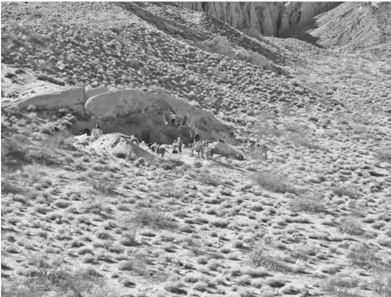
Figure 4. CA-SBR-1197 is situated on a northwest-facing slope at the base of an eroding sandstone formation.