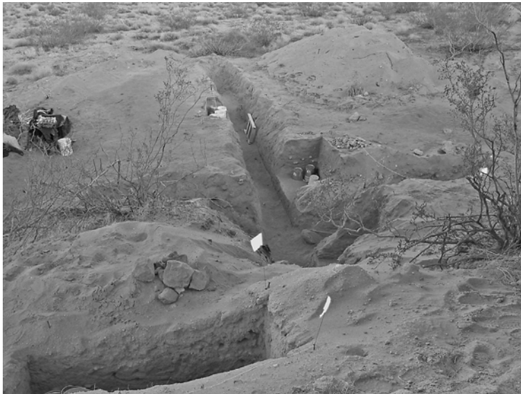
Figure 8. 2002 T-trench with first units placed into the wall of the trench. The 1 x 2 m unit in the foreground was begun in 2001 and completed in 2002.

location for those who occupied the site, and dirt piles left from the illicit digging. Prior to the second excavation phase in 2002, a T-trench was dug by backhoe into the site, exposing the soil profile across the entire site (Figure 8). The primary trench was dug from the lower elevation of the site to the upper elevation under the shelter. The cross trench was placed at the upper end of the site in front of the shelter. Units were excavated into the sides of the backhoe trench (Figure 9), and