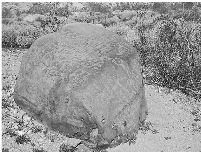
Figure 5. Boulder containing rock art located at lower site boundary of CA-SBR-1197.

that the rock art is contemporaneous with occupation at the sheltering outcrop, the fact that one of the large boulders containing rock art sits at the lower boundary of the site is suggestive of cotermporal activity. Excavation was carried out at the base of this boulder, but no cultural materials were located. Several more boulders with rock art are located within .8 km of the site.