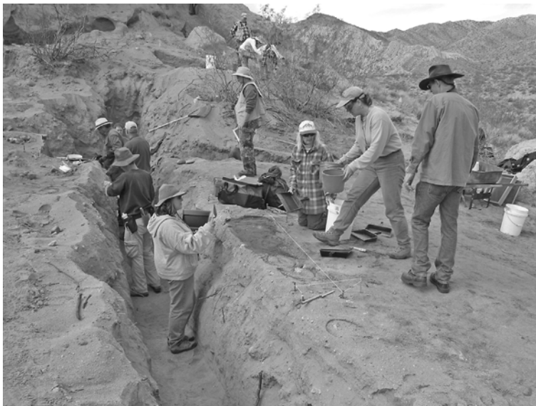
Figure 9. Second excavation phase (2002), excavating units in sides of T-trench; in background, excavation of a 1 x 2 m unit begun during the first excavation phase in 2001.