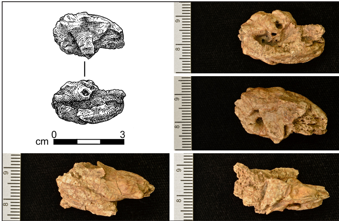
Figure 3. Fragment of a pinniped tympanic bulla from CA-ORA-291, subunit X1C4, 70–90cm. Drawings by Joe Cramer; photographs by Bruce Rubin.