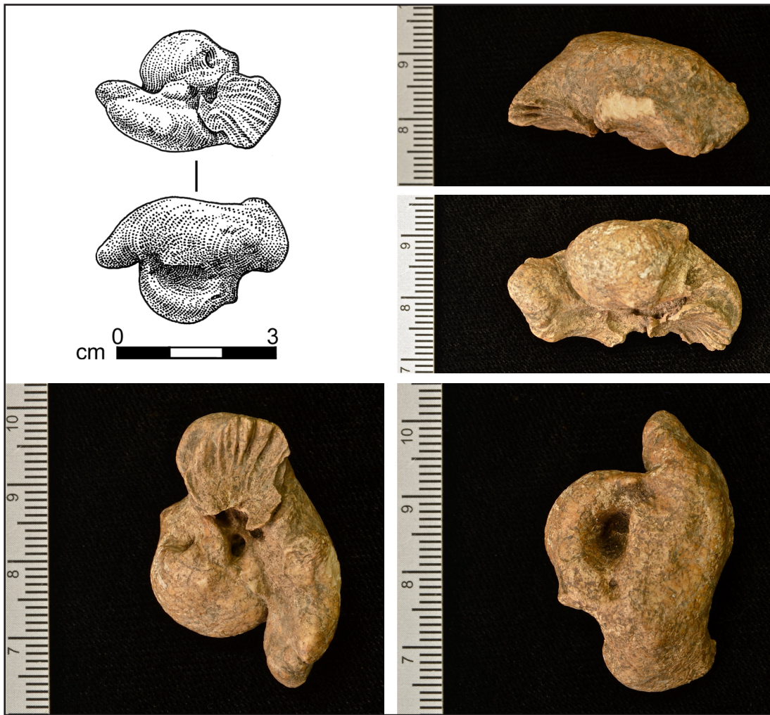
Figure 2. Dolphin petrosal from CA-ORA-291. Drawings by Joe Cramer.

appear as an unusual-looking “keeper,” would necessitate forceful removal away from other bone, leaving telltale signs of breakage. Such damage is visible on the squamosal portion of the ORA-91 specimen (see Koerper et al. 2014:Figure 3). Again, unlike a dolphin petrosal, the pinniped bulla will not lift out intact and unscathed.