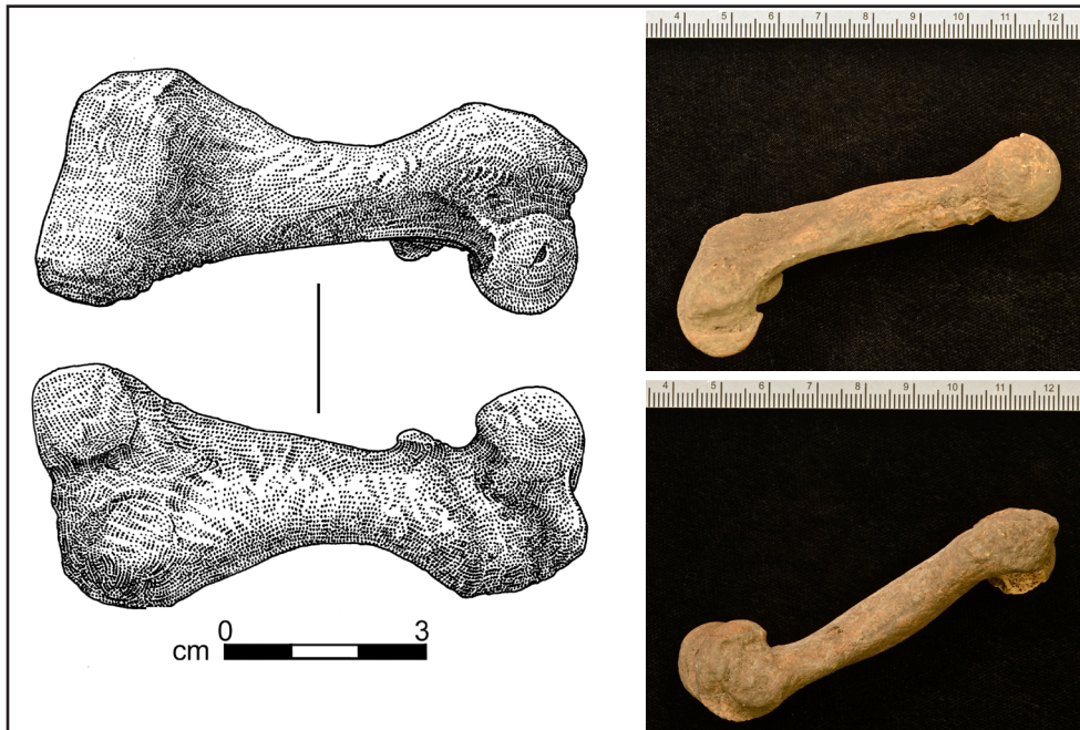
Figure 4. Right femur, possibly from a female fur seal, from CA-ORA-291, subunit X1C4, 70–90 cm. Drawings by Joe Cramer; photographs by Bruce Rubin.