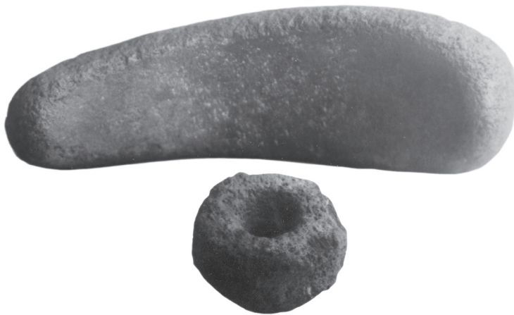
Figure 3. Photograph taken by S. C. Evans of a cogged stone and atulku owned by Bill Magee. Ca. 1930. Courtesy Riverside Metropolitan Museum, Samuel Wayne Evans Collection, Gift A1524.