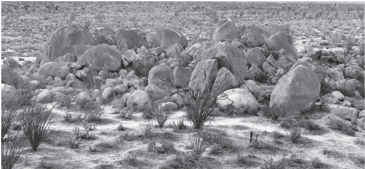
Figure 2. The Mine Wash site (CA-SDI-813).

correlating well with historic accounts of ancient trail systems (Quinn and Burton 2009:282). For example, compositional analysis of 115 sherds from the Anza-Borrego desert site of Mine Wash, or CA-SDI-813 (Figure 2), which has a ^{14}\text{C} date of AD 1590–1640 for the ceramic stratum (Sampson 1984), and comparison with a growing database of ceramics and raw materials from San Diego County highlight two main patterns in the movement of pottery and people to and from the site (Quinn et al. 2011). The majority of the sherds analyzed are composed of fine sedimentary clays that were tempered with particulate matter such as sand and grog (Figure 3A–C). These ceramics are likely to have originated in the desert lowlands to the east. A second group of pottery fabrics at Mine Wash is characterized by residual clay from the weathering of various types of plutonic igneous rock including granite, tonalite, and diorite (Figure 3D–F). Ceramics of these fabrics are common at sites in the mountains to the west and match clay deposits that form in this wetter environment. Three specific residual igneous compositions that occur at previously studied Laguna Mountain sites (Quinn et al. 2011) are present in small but significant numbers