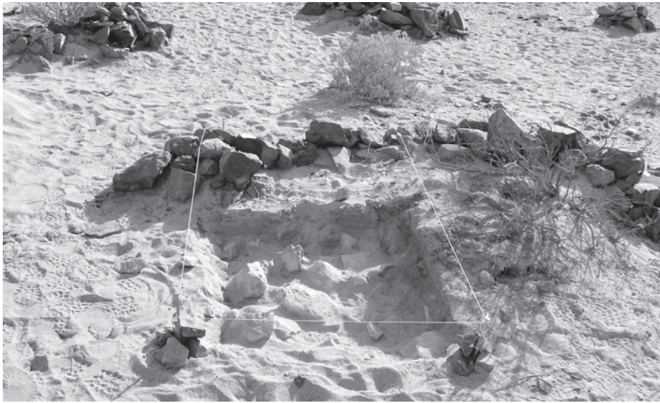
Fig. 7. Rock alignment (Feature 4) during excavation, CA-SBR-12134/H.