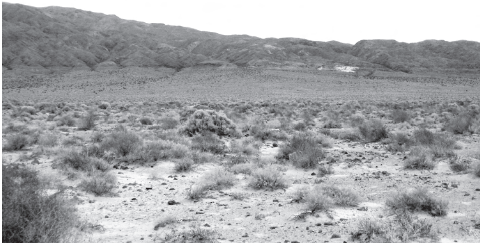
Fig. 1. Eastern side of Searles Lake looking toward the Slate Mountain Range.