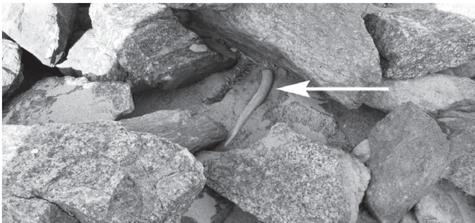
Fig. 5. Arrow points to antler tip inside rock cairn, Locus A.