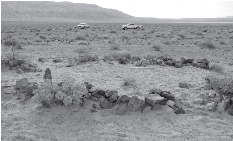
Fig. 4. CA-SBR-12134/H, Locus A, proposed habitation area.