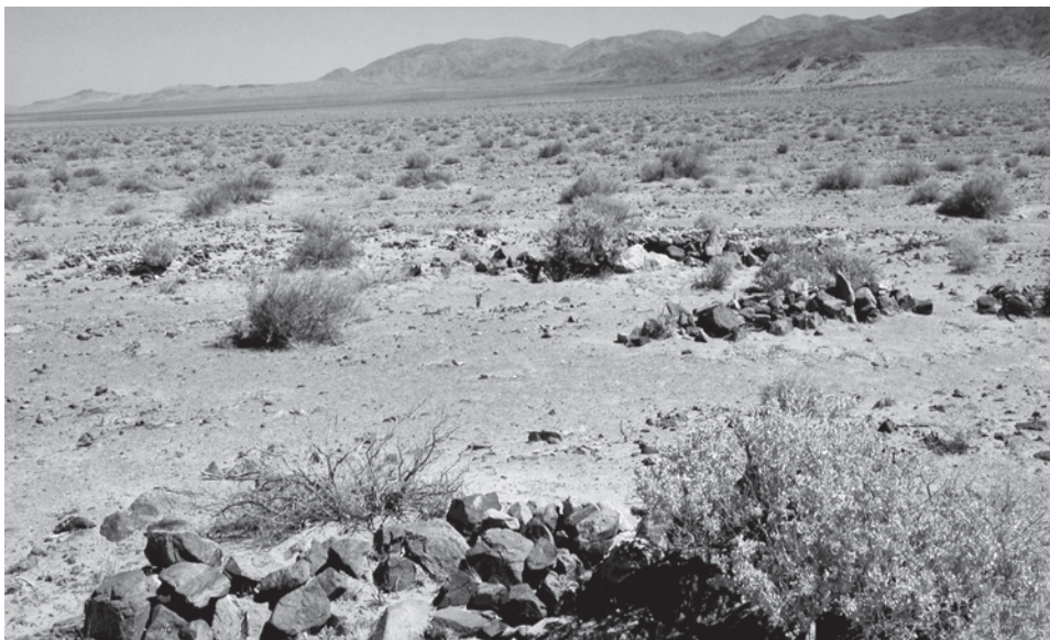
Fig. 2. Rock Features at Eastern Searles Lake site CA-SBR-12134/H.

Cairns are a common type of feature that consist of piled stacks of rocks placed in a circular fashion. Jett (1986:615) identified 35 native ethnic groups in North America that employed trail side cairns. The function of cairns is not always obvious, although there are instances where they were used in mortuary practices, to cover the dead, or as cairn burials (Halford and Carpenter 2005). Moratto (1984:129–130) noted several sites on the Santa Barbara sub-