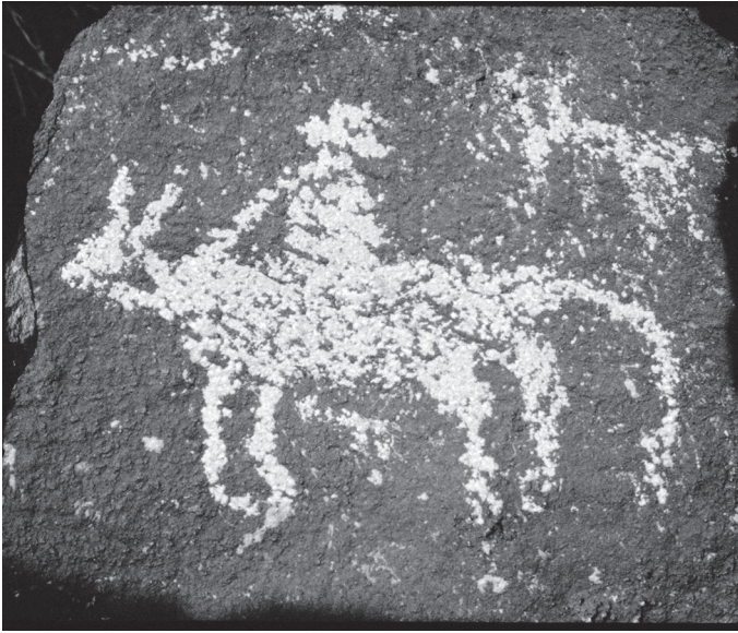
Fig. 1A. Horse and rider petroglyph, Birchum Springs Site, Coso Range..