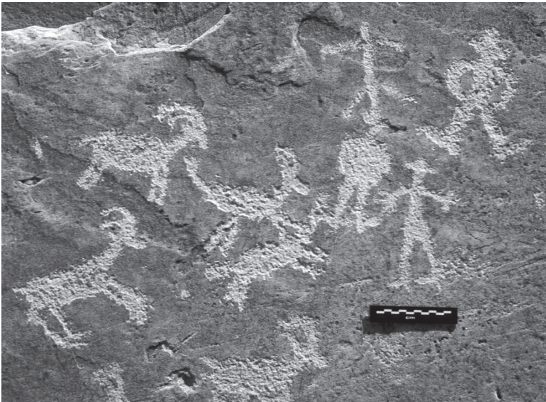
1B. Cowboy-hatted human figures and bighorns, Las Vegas area, Nevada.

is clear that Grant's totals are likely off by (roughly) an order of magnitude, these nonetheless can be considered statistically representative sample sizes. Using a simple three category scale of (i) little or no visible revarnishing, (ii) moderate revarnishing, and (iii) complete revarnished, the following estimates resulted: