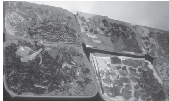
Fig. 1.2. Artifacts and faunal remains from one level of one unit.

Those who teach field classes are aware that they are not able to produce professional archaeologists in a mere field school session. Some students do not have career goals in archaeology and are seeking an interesting summer experience. Some of those who are interested in archaeological careers find, in their field experience, that archaeology is not what they thought