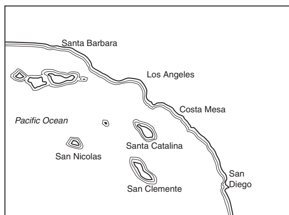
Fig. 1.1. Southern channel islands of California.

Our cooperative research agreement had a number of objectives which meet both NAS North Island and University interests. On the Navy side, there is the need for investigation and data gathering on the cultural resources of the island so that appropriate management decisions can be made. Where archaeological remains are particularly threatened by natural causes or plans for future land use, there is a particular need to retrieve as much information as possible. Where archaeological sites have been damaged by earlier construction or road-building, there is a need to